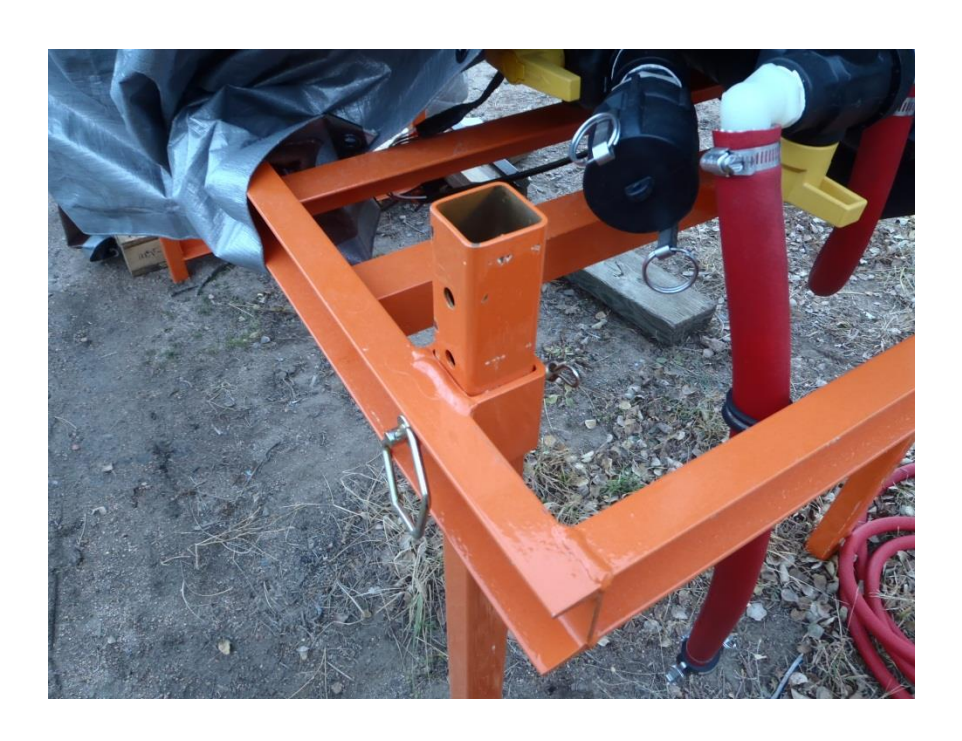
Pic 3- push unit in so frame contacts the bed bulkhead firmly.