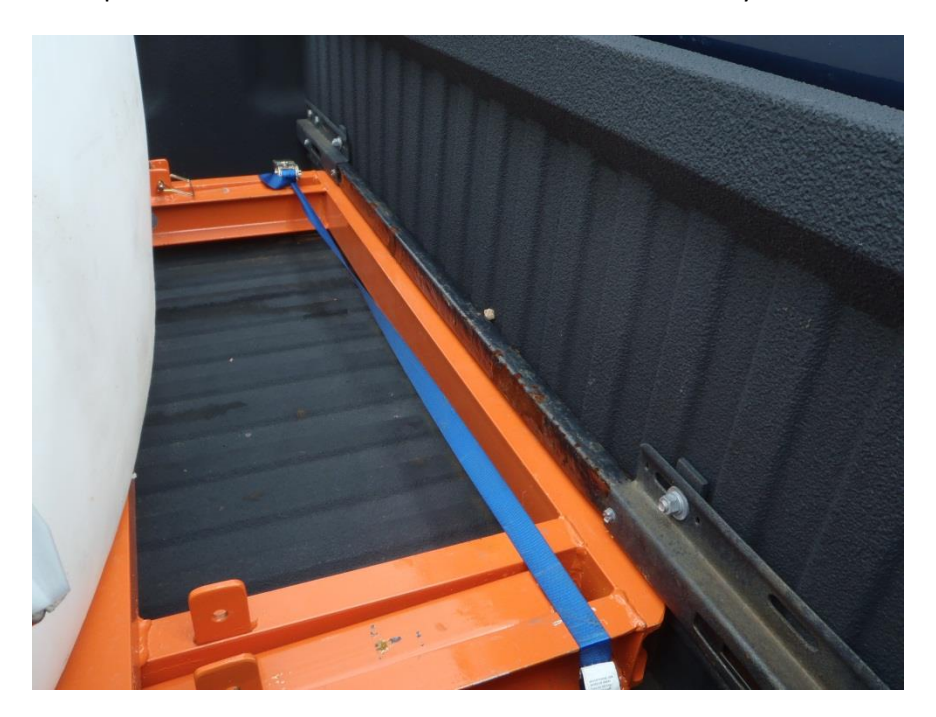
If you have to drive long distances with the tank unloaded put a small ratchet strap (blue in the pic) across the front of the frame to keep it from bouncing or shifting.