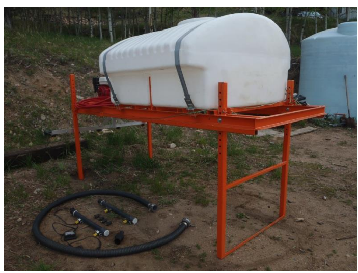
Pic 2- Back leg detail with hitch pin in place.